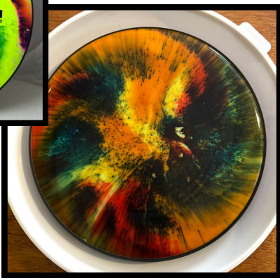
Not rotated as much